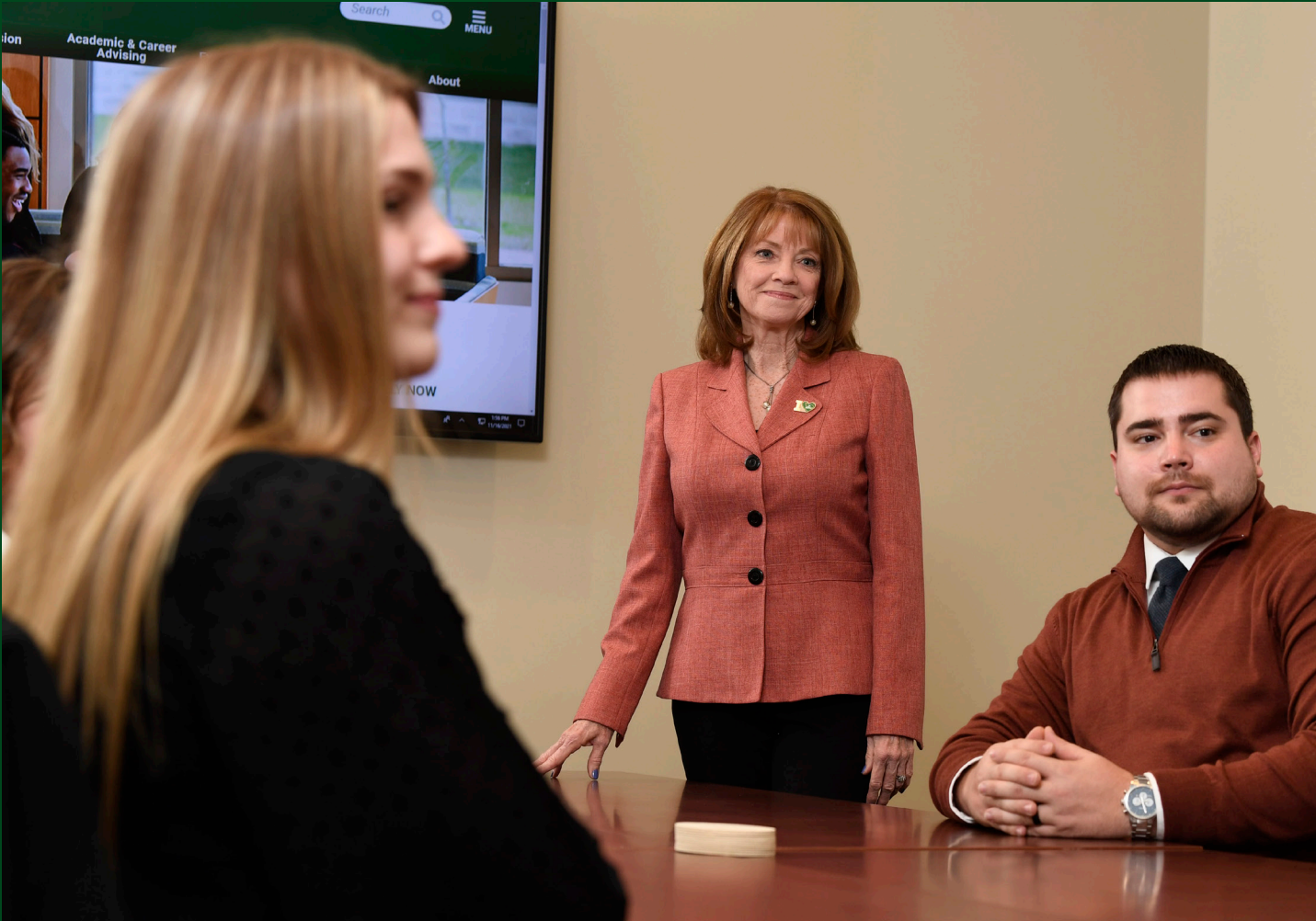
Business students attend the Professional Development Day organized by the college’s Center for Career Development.