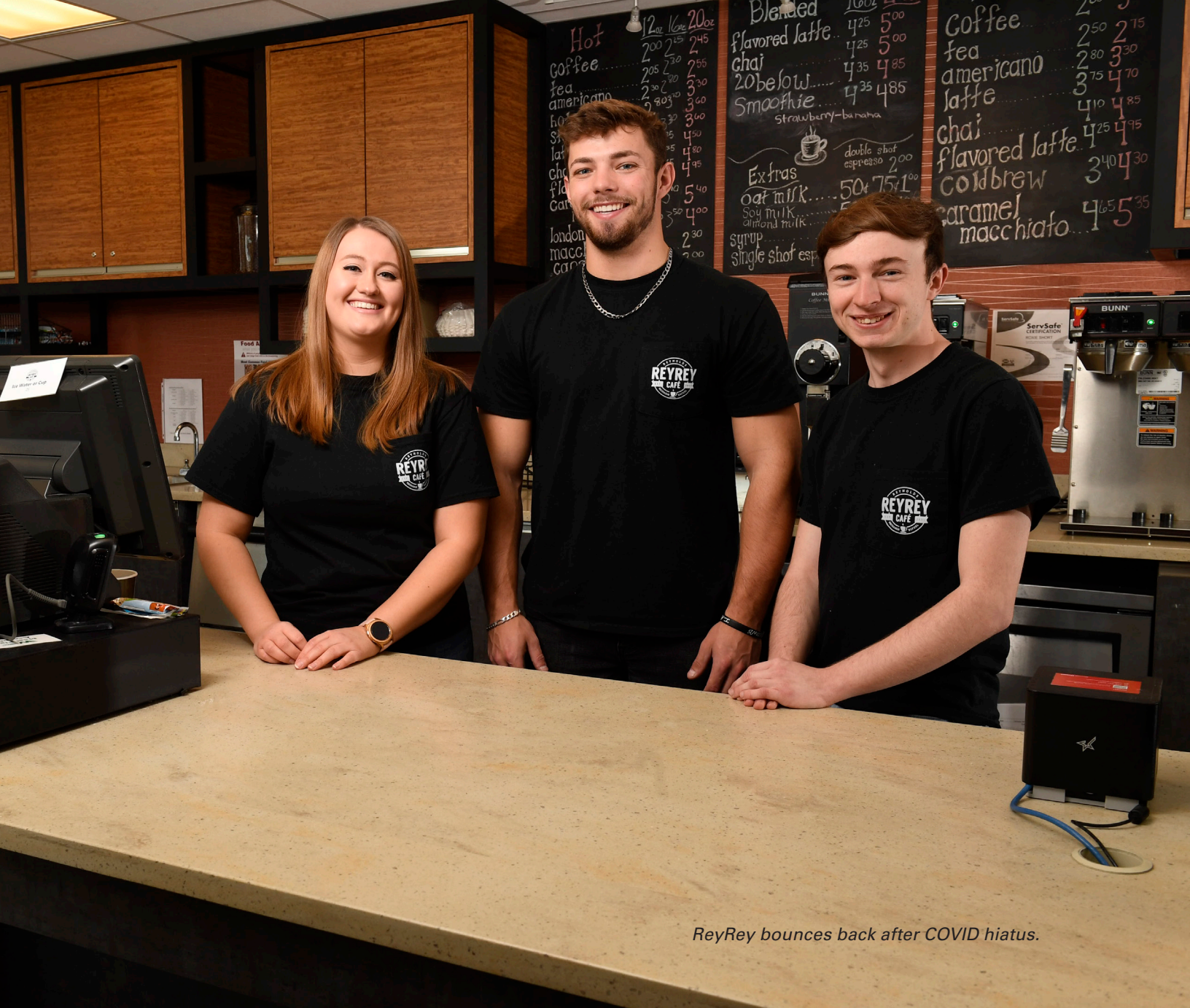
ReyRey bounces back after COVID hiatus.